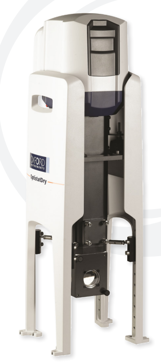
Optistat Dry Cryofree cryostat from Oxford Instruments

Zurich Instruments' MFLI uses the latest hardware and software technologies to bring the benefits of high performance digital signal processing to lock-in amplifliers at medium and low frequencies. The MFLI features a differential voltage input as well as a current input, a dual-phase demodulator and a high quality signal generator, covering a frequency range DC to 500 kHz or DC to 5 MHz. With its superior performance and outstanding tool-set, the MFLI defines a new standard for lock-in amplifiers.