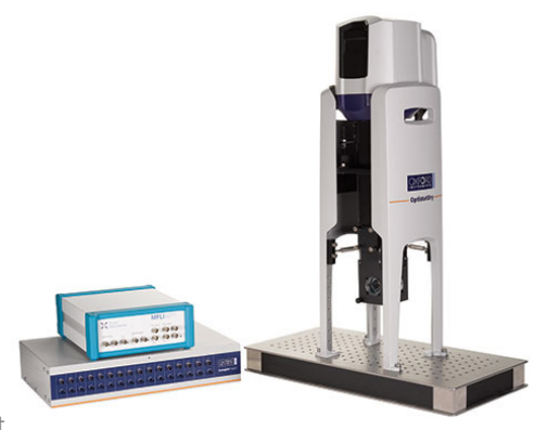
Figure 1. Sample Protect measurement system set-up including Optistat ™Dry cryostat, MFLI Lock-in Amplifier and an ESD break-out box – used for this application.

This application note describes an experiment to measure the resistance of High Temperature Superconductor (HTS) tape and determine the superconducting transition temperature, T_c . The measurements were carried out using Oxford Instruments' Optistat Dry cryogenic system with the demountable sample puck option, combined with a Zurich Instruments' MFLI (Medium Frequency Lock-in) amplifier. The experiment demonstrates the adaptability and controllability of the cryogenic platform as well as the ability of the MFLI to resolve small signals with excellent background noise rejection.