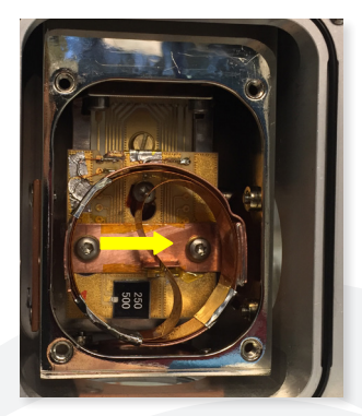
Figure 2. YBCO coil (marked with the arrow) mounted on the sample puck

The OptistatDry was set-up with the MFLI and a ESD break-out box (see Figure 1). SuperPower 2G YBCO HTS tape, from Furukawa Electric was used as the sample. A 500 mm length of this tape was coiled in a noninductive loop and mounted to an Optistat Dry sample puck using a custom made copper bracket (see Figure 2). The 12 mm wide tape had voltage taps applied 15 mm from each end, giving 470 mm between the voltage taps. Current supply terminals were added at each end of the tape to provide an excitation current through the tape. The sample puck included a CX 1050 SD Cernox<sup>TM</sup> sensor and a 50 \Omega 25 W surface-mount heater. The room-temperature end-to-end resistance of the current loop (HTS sample plus wiring loom plus cabling) was 149.2 \Omega measured at the break-out box terminals. The Optistat Dry heat exchanger also has a CX 1050 SD Cernox<sup>™</sup> sensor and a heater. The system, under Mercury iTC control, allows for simultaneous sweeps of the heat exchanger and sample puck temperatures at precise user selected rates. To resolve the superconducting transition in the YBCO, temperature sweeps were conducted at 0.1 K/min, 0.05 K/min and 0.01 K/min over the transition region. The MFLI was used, both as a low-distortion function generator and as a Lock-in Amplifier to recover the small demodulated response. Its Scope capability also allowed monitoring of the input signal in real time.